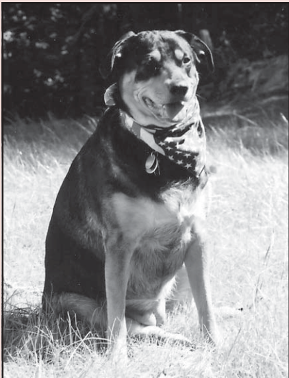
Lulu Kuehnl Current donor